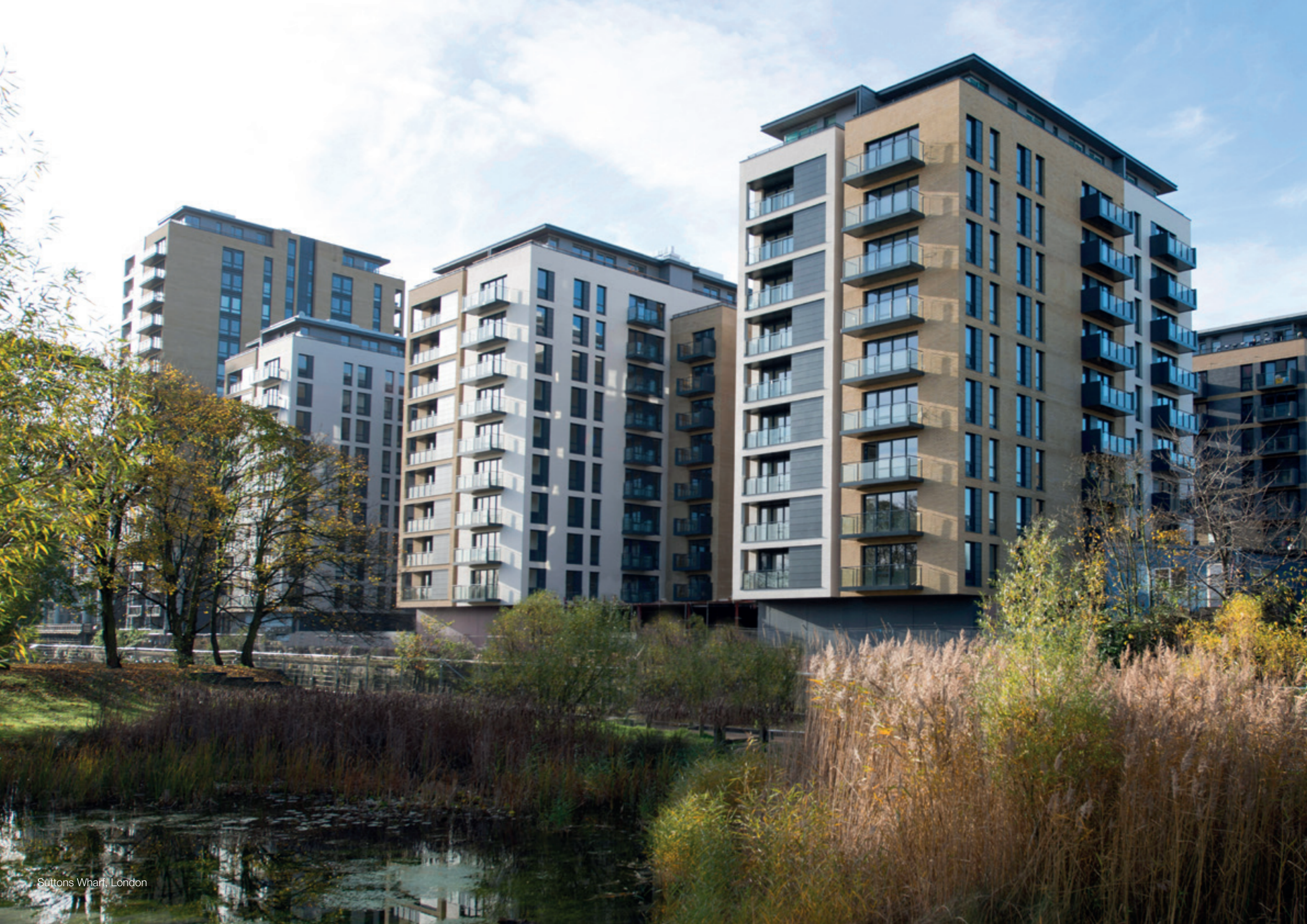
Suttons Wharf, London