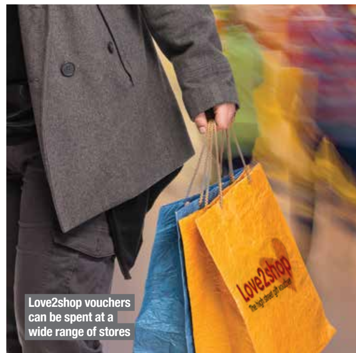
Love2shop vouchers can be spent at a wide range of stores