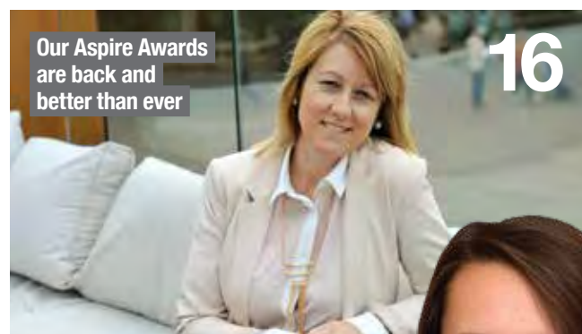
Our Aspire Awards are back and better than ever