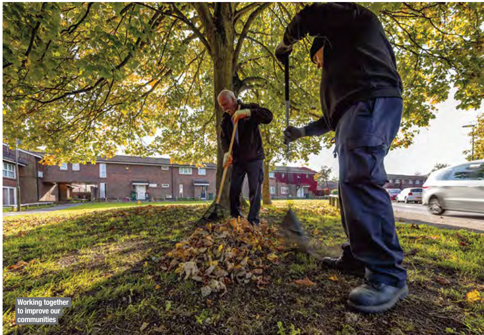
Working together to improve our communities