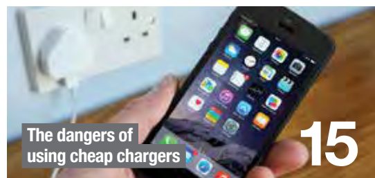
The dangers of using cheap chargers