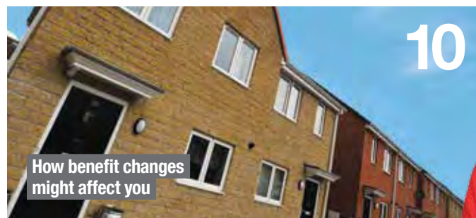
How benefit changes might affect you